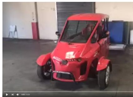
Hula National City 14 views · Nov 10, 2020

On November 10, 2020, Hula uploaded a new video from a different warehouse in National City that was full of Ayro 311 vehicles from Arcimoto’s direct competitor.